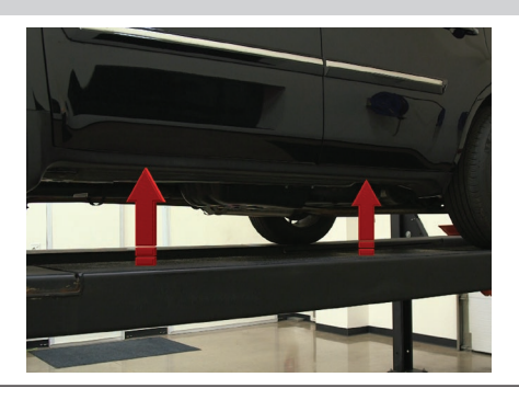
Driver side brackets

Starting on the driver side, locate the two mounting locations along the body.